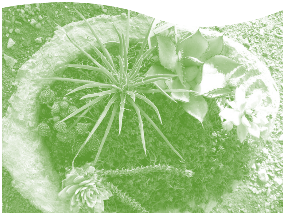
Hypertufa trough planted with succulents.

Adult/child pairs work together to create a fairy-sized outdoor container garden sure to entice any pixies wandering through your neighborhood. Elizabeth will help you plant a container with fairy-scale plants and construct fairy furniture to set the scene. Set it outside to attract magical creatures or add your own favorite fairy statuettes.