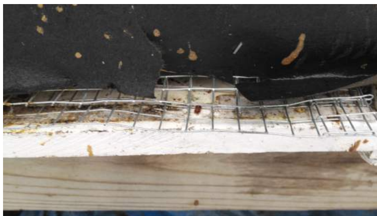
Figure 5. Lower hive entrance with mouse guard in place. Note the bee fecal deposits on the tar paper over the entrance.

Animal damage and vandalism are problems that you should be aware may exist and you should protect your hives. In the fall, mice start looking for nice warm places to spend the winter. They are able to crawl in through your lower hive entrances when the bees begin to cluster and are not “at the door” to drive away intruders. To prevent mice from destroying frames in your hives and eating your clustering bees, place mouse guards in your lower entrances. There are nice ones available commercially, or you can make your own very easily using hardware cloth. Cut it to fit the width of the hive entrance, and ensure that it is at least three times the height of the entrance. Fold it in half and push it into the entrance (Figure 5). Elevating your hives using a hive stand is also helpful (see Figure 4).