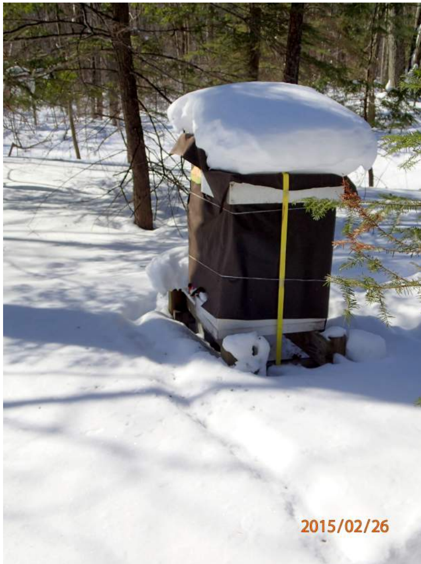
Figure 4. Beehive packed for winter. This hive is protected from direct wind by a tree barrier. It has been wrapped with tar (roofing) paper, an upper entrance was provided at the rim of the inner cover under the insulated telescoping cover, and it is strapped to the hive stand to help prevent accidental toppling due to wind, animals, or vandalism.

Both extrinsic and intrinsic factors will impact the ability of a colony to survive the winter. The main extrinsic factor affecting survival is weather . Winters vary considerably...they may be wet and cold, dry and cold, wet and mild, dry and mild, windy, icy, etc. We cannot control or even reliably predict the weather, but we can optimize colony housing conditions and food stores. It is important to choose a suitable hive location, ensure that hive furniture is in good condition and properly ventilated, and leave adequate honey stores in the hive. All these things can be readily optimized by the beekeeper and must be done while temperatures during the day are still above 50°F (10°C) because opening colonies in the cold is at best stressful, and at worst, lethal.