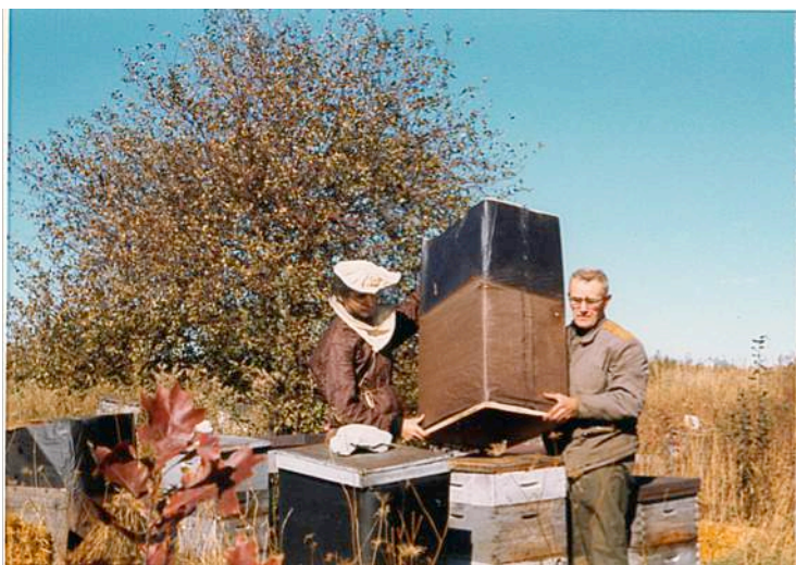
Figure 6. Old hive boxes are often warped or damaged at the corners. Such hives must be wrapped for winter or the bees will suffer from killing drafts. These hives are being covered with foldable, reusable insulating jackets made of corrugated waxed cardboard and tar paper.

Your hive furniture should be tightly fitted together. Bees do not heat the hive, they only heat their cluster. Drafts can drain the heat out of the bee cluster and will kill the bees. If you have old brood boxes that are warped or display hive tool damage, such boxes will have gaps that can